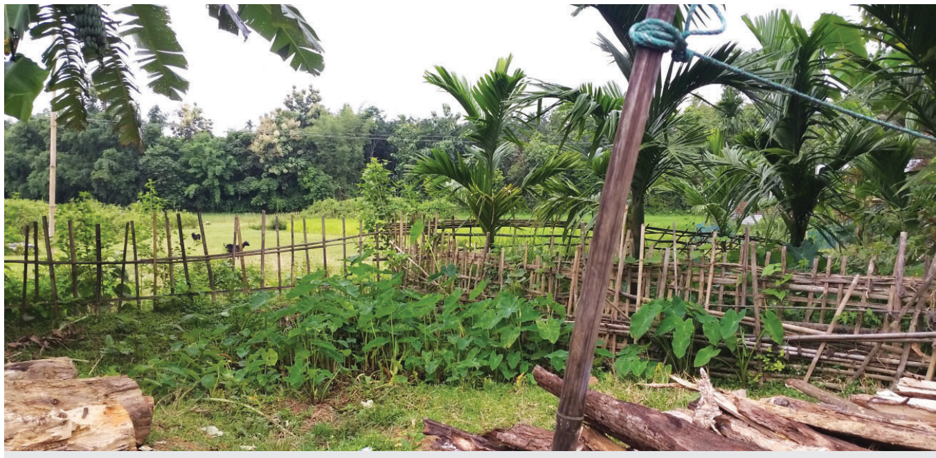
Medicinal Plants at Madhav ojha's House

Illness: Unable to pay for medical services, villagers usually consult ojhas, although we were told that an ojha also charges a 'hefty amount' for his services. Lack of health infrastructure and lack of transport facilities make people visit ojhas/ kabirajs to be cured of their illnesses. Besides, there is also a strong belief in the medicinal value of local herbs and plants and illness is largely seen as a result of an evil eye or witchcraft. This occurs in remote villages far away from block or district health centres and without any transport facilities. Deepali Rabha, a deodhani<sup>1</sup> herself, was alleged to be a witch by another deodhani, who was apparently known to be associated with a more powerful ojha in the village or in another village was engaged in treatment of the illness of her neighbour, who became weak after a miscarriage.