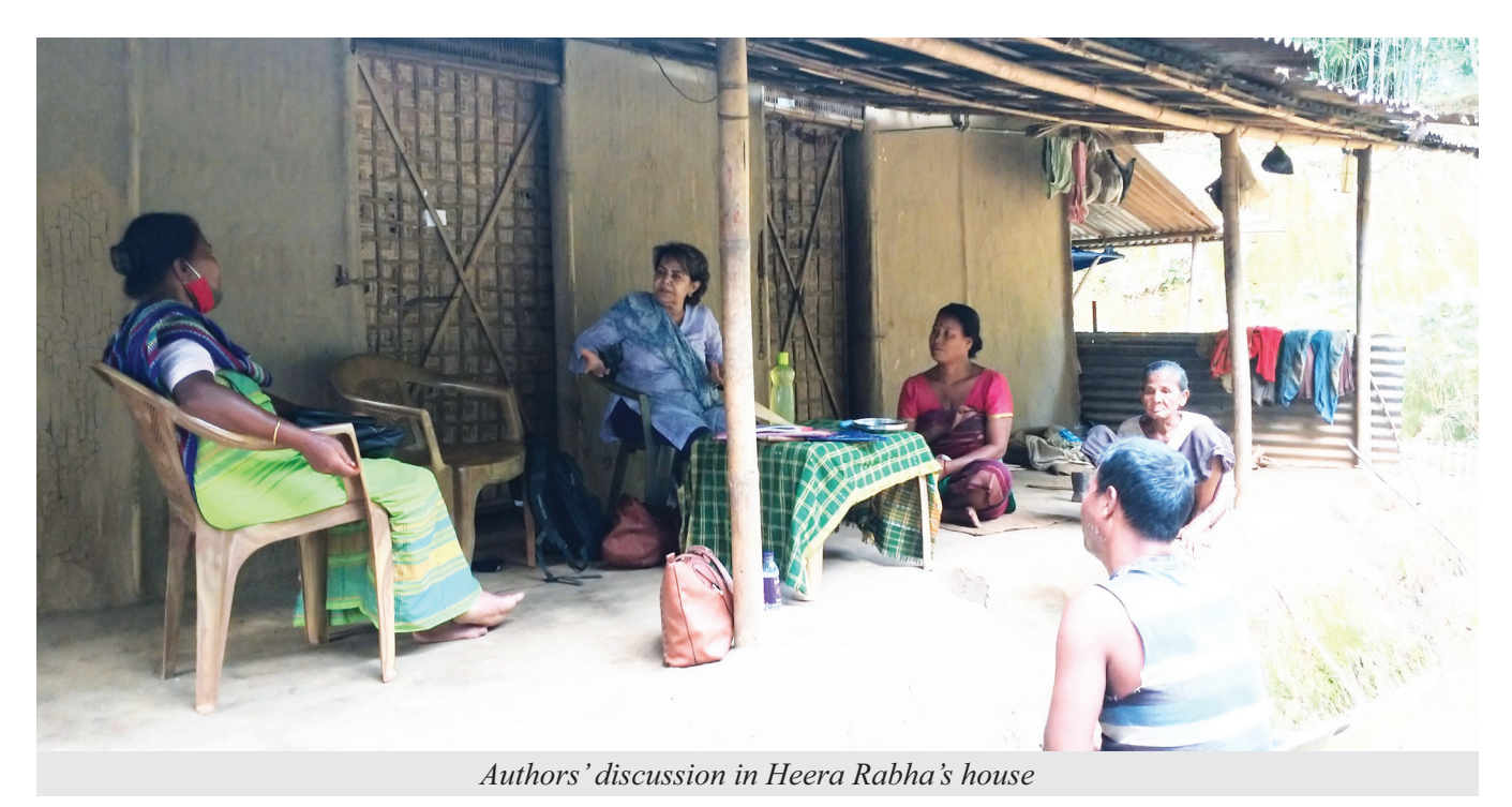
Culture, Capital, and Witch Hunts in Assam

adversely affecting primary livelihoods. A similar belief system exists among the Bodo and other indigenous peoples in Assam. The daini (witch) and the ojha/kabiraj (witch finder and healer) constitute an inseparable part of the everyday rituals of the indigenous culture and the traditional knowledge system. The daini, who symbolizes evil, is mostly a woman from a marginalized household in the village. Her powerlessness is further exploited by the ojha (mostly male), by branding her a witch. In the 19 cases we collected information on during our study, the primary reasons for which the women were accused as witches were: conflict over land/ property, jealousy, prolonged illness of someone in the village, spiritual possession (deu utha) and others. In most cases, it was found that there was more than one reason for such allegations, which not only violated the basic human dignity of the alleged witches, but further marginalized them. They were subjected to violence and trauma through torture and indignities such as hair-pulling, the pulling out of nails, being forced to eat human excreta and being driven out of the village to live a life of seclusion and insult. The women narrated these stories to us with tearful eyes and in choked voices.